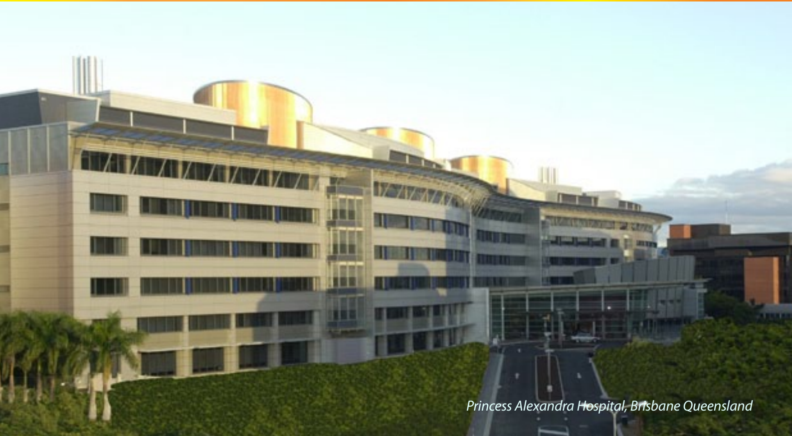
Princess Alexandra Hospital, Brisbane Queensland

9-12 September 2009 | Gold Coast International Hotel